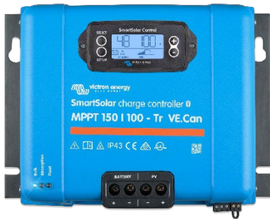
SmartSolar Charge Controller MPPT 150/100-Tr VE.Can with optional pluggable display