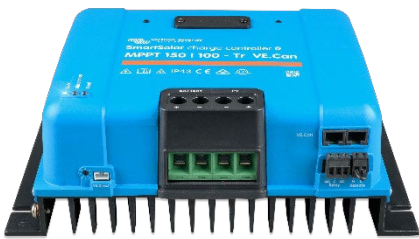
SmartSolar Charge Controller MPPT 150/100-Tr VE.Can without display