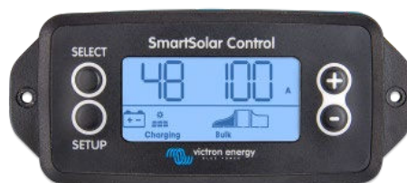
SmartSolar pluggable display