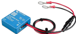
Bluetooth sensing: Smart Battery Sense