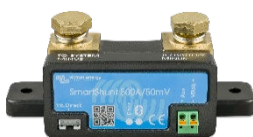
Bluetooth sensing: SmartShunt